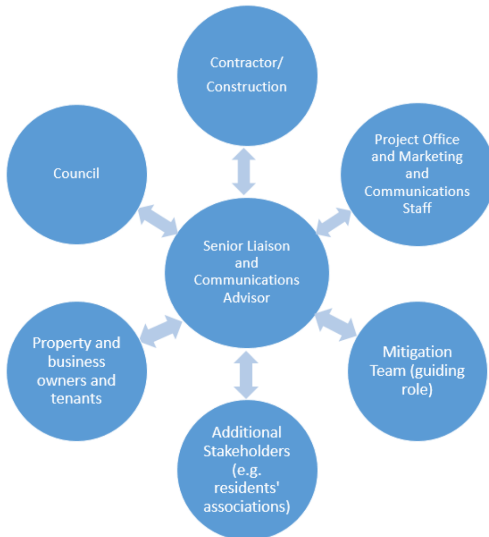
Figure 1 – Key Stakeholders

The SLCA will be stationed at the Downtown Project Office, once the office has opened. It is expected that construction on the Project Office will be completed in May, 2018.